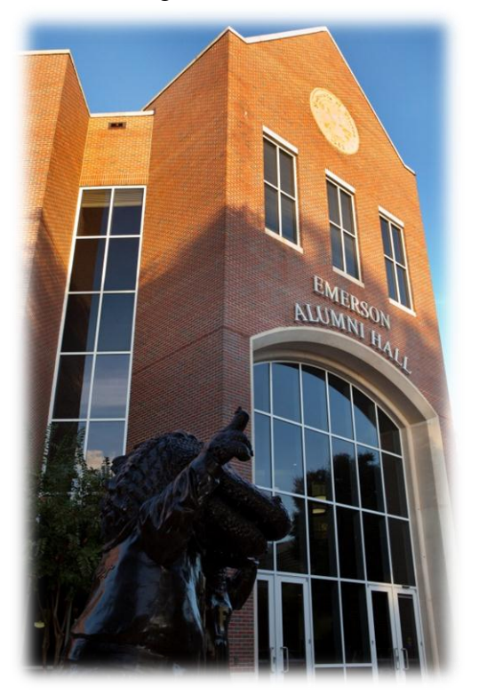
Figure 1: The 2<sup>nd</sup> Climate Change Task Force Workshop was held on November 14-15, 2011 at the University of Florida's Emerson Alumni Hall.

The main object of study of this document is the formal and non-formal educational curricula on climate change available in Florida. Therefore, an account of related outreach and professional development programs sponsored, developed, and/or delivered by governmental agencies, non-governmental organizations, and the private sector is included. However, it is not possible to claim