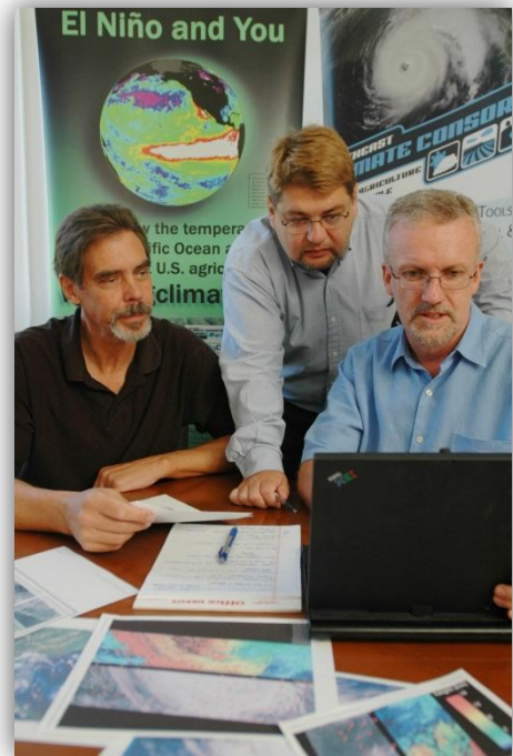
Figure 13: Researchers from UF and UM collaborate in a variety of climate-related projects through the Southeast Climate Consortium.

Established in 1990, the Center for Environmental Diagnosis and Bioremediation (CEDB; http://uwf.edu/cedb/index.cfm ) at the University of West Florida provides a vital program of research and education. The CEDB collaborates with affiliated academic departments and diverse external organizations, including the Florida Institute of Oceanography and NOAA, to enrich the research, teaching, and service functions of the University of West Florida. The center emphasizes the application of modern biological research to environmental systems, engaging in basic and applied research pertinent to the assessment and improvement of environmental health and providing research and training opportunities for graduate and undergraduate students. The CEDB engages in basic and applied research pertinent to the assessment and improvement of environmental health; provides research opportunities and academic programs in life and environmental sciences; and contributes to public service, including K-12 science education enrichment.