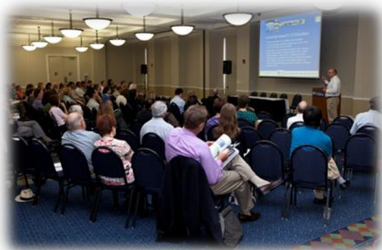
Figure 14: The 2 nd Climate Change Task Force Workshop on November 14-15, 2011 brought together representatives from academia, governmental agencies, NGOs, and private sector to discuss about cooperation in climate change.