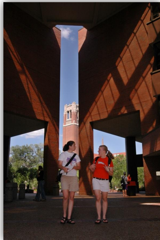
Figure 4: Students walking outside of UF's Marston Science Library.

An attempt was also made to identify all science education faculty who are involved in teaching climate-related courses in the SUS and the University of Miami. We found 31 such faculty in the SUS, including three at UM. Emails were sent to all 31 on July 7 informing them of a planned Showcase and Symposium organized by the Coastal Areas Climate Change Education Partnership (CACCE), and asking them if they are involved in any climate change efforts, including any university or professional development courses. Fourteen responded to that email. A second email was sent on August 9 to all those who had not yet replied; an additional response was received in response to that second request.