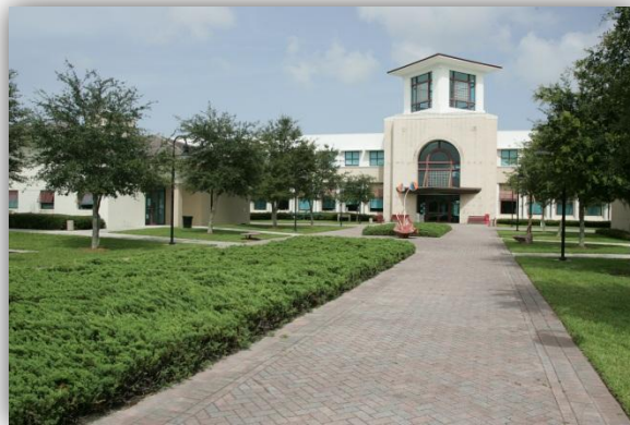
Figure 15. The Florida Center for Environmental Studies (CES) is housed at FAU's Jupiter campus.

The United Nations Environment Programme Finance Initiative (UNEP FI) through the Climate Change Working Group offers consulting services and ongoing online courses, such as “Climate Change: Risks and Opportunities for the Finance Sector Online Course” ( http://www.unepfi.org/training/climate-change/index.html ). Their purpose is to provide education on the relevance of climate change within the context of financial industries such as banks, insurers, reinsurers and fund managers. The target audience is executives, managers from financial institutions, governments and citizens.