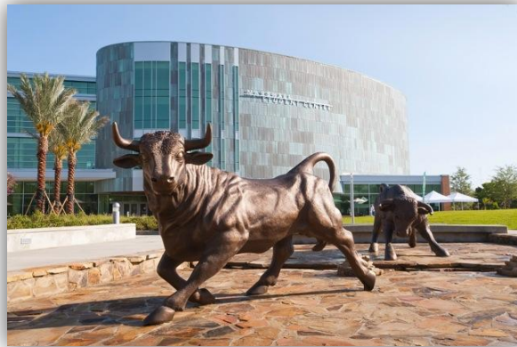
Figure 9: Marshall Student Center at the University of South Florida.

develop and practice skills related to global sustainability, broaden their knowledge and understanding of global determinants. Also, potential solutions to sustainability issues can be identified through the integration of issues related to science, policy and management in making decisions related to sustainability. To explore the effects of environmental factors on health and access to health care, undergraduate students have access to four courses within the life sciences dealing with these issues. Two of these are Level 2 courses related with human behavior and the environment, where students can learn the principles of behavior analysis applied to global environmental and social issues. The other two courses are Level 3 and place the foundations of public health in a global context to understand how environmental changes impact personal and global health and nutrition. Finally, three courses within the social sciences explore the societal impacts of weather as well as the human impact on weather and climate, examining global problems of economic growth and development, geopolitical relations among nations and states, food supply and hunger, and environmental change. Many of the courses identified at USF are part of the programs organized under the Patel School of Global Sustainability, a program based on integrated interdisciplinary research, scholarship and teaching. USF courses were evaluated using Strategy A.