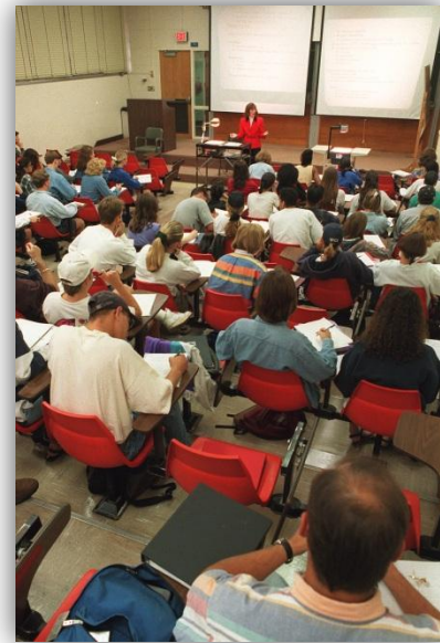
Figure 1: Graduate and undergraduate courses are important areas to advance climate science literacy.