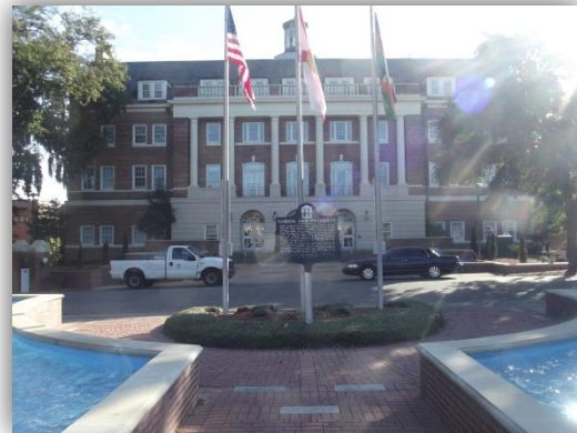
Figure 5: Campus of the Florida Agricultural and Mechanical University.

Faculty at FAU teach 40 courses within the Earth and physical sciences, and most of these courses are categorized as Level 2 or 3. However, there are two graduate courses that are Level 1, focusing on global environmental change and coastal hazards. The Geosciences Department within the College of Science offers the largest share of the courses (24), from fundamental basic climate coursework to in-depth graduate courses. Twelve courses are offered in the College of Engineering and Computer Science, such as Sustainability Leadership for Engineers, Stormwater Modeling, and Dynamic Hydrology. Oceanography courses at FAU, such as Marine Global Change (a Level 1 course), are split between the College of Science and the College of Engineering and Computer Science for the Ocean Engineering program.