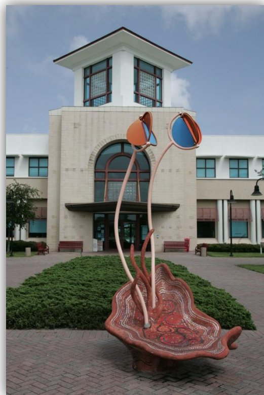
Figure 6: Campus of the Florida Atlantic University.