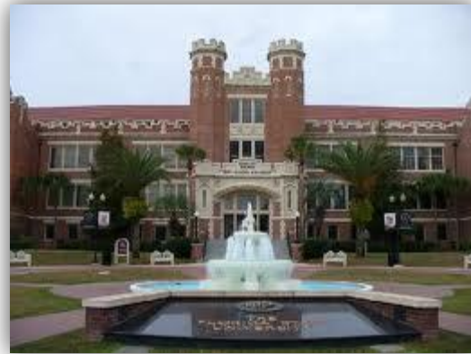
Figure 7: Campus of Florida State University.

Disciplines in the Earth and physical sciences house 49 of these related courses. The majority of these (31) are Level 4 courses that provide students with foundations in sciences, such as physics, geology, climatology, and meteorology, which are necessary to understand the underlying physical principles of climate change. Students become engaged in discussions of current ground-breaking research, environmental problems, and approaches to solving them, including the use of explanatory and predictive models of the earth's systems and environmental processes therein. Content in these courses also covers such areas as climate modeling, physical climatology, dynamic climatology, climate change, plus climate and the oceans. Five courses in the Earth and physical sciences can be categorized as Level 1 because they have a strong focus on climate change. These courses are mainly for graduate students and deal with the Earth system, the global climate system, paleoceanography, and climate science.