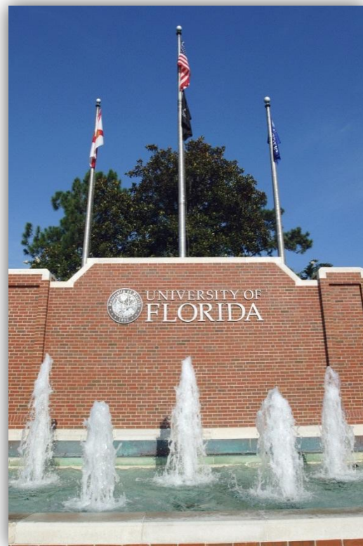
Figure 8: University of Florida's main entrance.