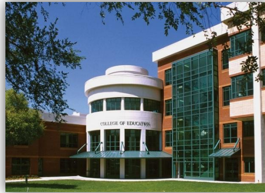
Figure 10: College of Education at the University of South Florida.