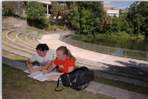
Figure 16: UF students work on their assignments in front of the Green Pond conservation area.

The implementation of the strategies proposed in this white paper will require the collective action of multiple stakeholders (e.g. university faculty, secondary teachers, policy-makers, etc.). Future collaborative opportunities will be abundant and must be productive, with a focus on situating climate change education (in all its different forms) at the center of the efforts to help society in the mitigation of climate change and in adapting to its current and future impacts. Leveraging existing educational resources available inside and outside of the state may help shortening the time and funds required for the development of effective programs.